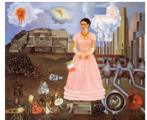
Self-Portrait on the Border Between Mexico and the United States